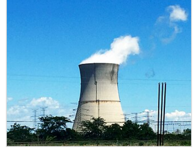
Davis-Besse Nuclear Power Station's cooling tower in July 2015