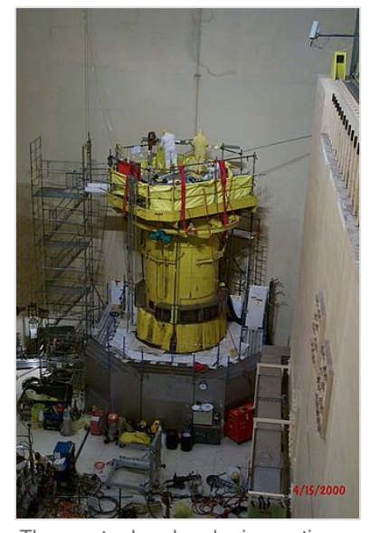
The reactor head under inspection