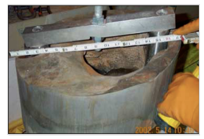
Erosion of the 6-inch-thick (150 mm) <u>carbon steel</u> reactor head, caused by a persistent leak of borated water

In March 2002, plant staff discovered that the <u>borated</u> water that serves as the reactor coolant had leaked from cracked control rod drive mechanisms directly above the reactor and eaten through more than six inches<sup>[23]</sup> (150 mm) of the carbon steel reactor pressure vessel head over an area roughly the size of a football (see photo). This significant reactor head wastage on the exterior of the reactor vessel head left only \frac{3}{8} inch (9.5 mm) of stainless steel cladding holding back the high-pressure ( \sim 2155 psi, 14.6 <u>MPa</u>) reactor coolant. A breach most likely would have resulted in a massive <u>loss-of-coolant accident</u>, in which reactor coolant would have jetted into the reactor's <u>containment building</u> and resulted in emergency safety procedures to protect from core damage or meltdown. Because of the location of the reactor head damage, such a jet of reactor coolant might have damaged adjacent control rod drive mechanisms,