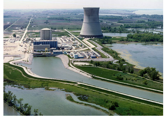
The Davis-Besse NPP